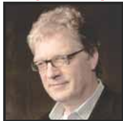
Sir Ken Robinson

internationally recognised leader in the development of education, creativity and innovation